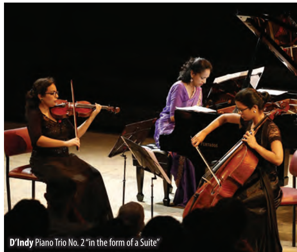
D'Indy Piano Trio No. 2 "in the form of a Suite"