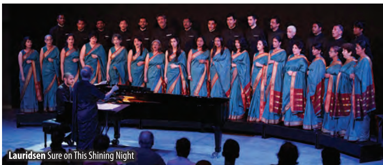
Lauridsen Sure on This Shining Night