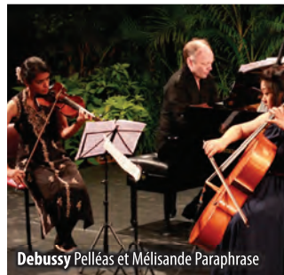
Debussy Pelléas et Mélisande Paraphrase