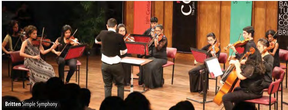
Britten Simple Symphony