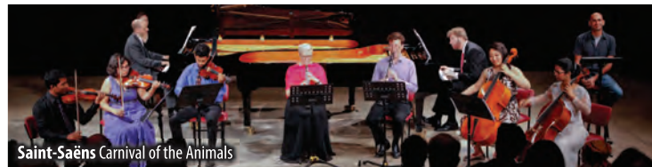
Saint-Saëns Carnival of the Animals