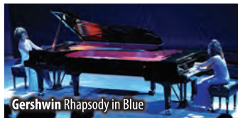
Gershwin Rhapsody in Blue