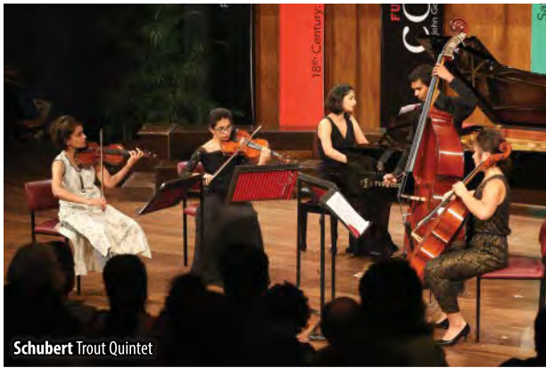
Schubert Trout Quintet