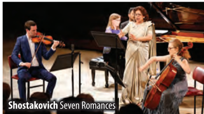
Shostakovich Seven Romances