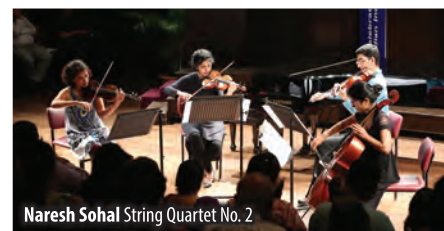
Naresh Sohal String Quartet No. 2