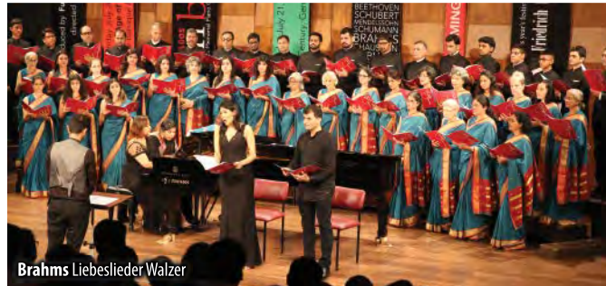
Brahms Liebeslieder Walzer