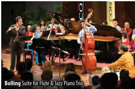
Bolling Suite for Flute & Jazz Piano Trio