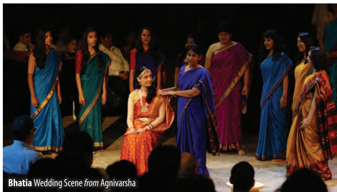
Bhatia Wedding Scene from Agnivarsha