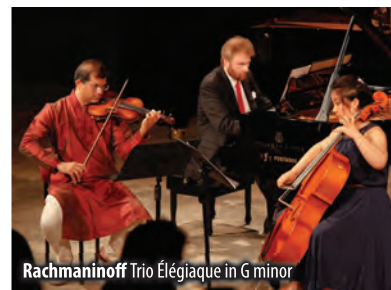
Rachmaninoff Trio Élégiaque in G minor