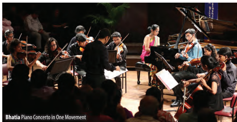
Bhatia Piano Concerto in One Movement

2017 Celebrating 70 years of Independence