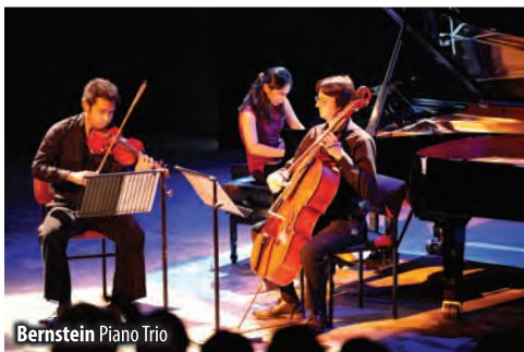
Bernstein Piano Trio