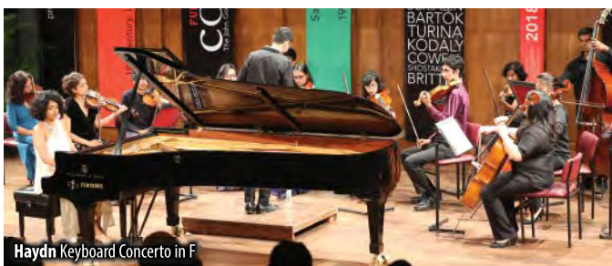
Haydn Keyboard Concerto in F