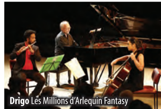
Drigo Les Millions d'Arlequin Fantasy