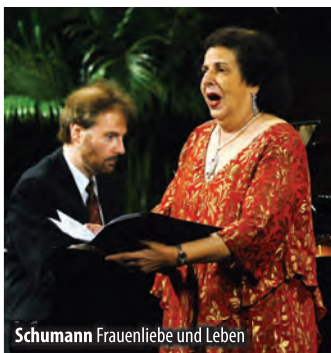
Schumann Frauenliebe und Leben