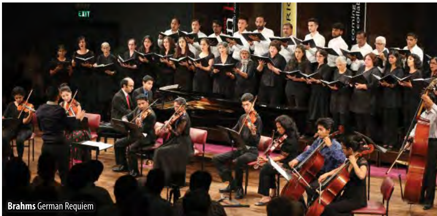
Brahms German Requiem