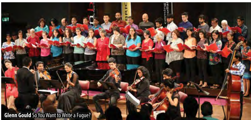
Glenn Gould So You Want to Write a Fugue?