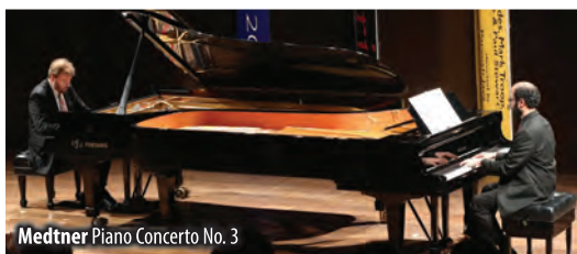
Medtner Piano Concerto No. 3