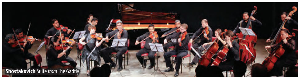
Shostakovich Suite from The Gadfly