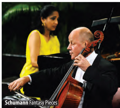
Schumann Fantasy Pieces