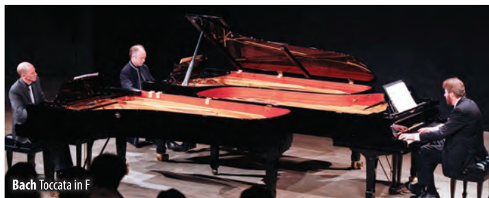
Bach Toccata in F