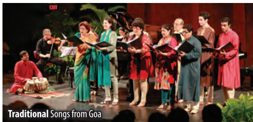
Traditional Songs from Goa