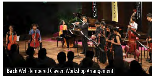
Bach Well-Tempered Clavier: Workshop Arrangement