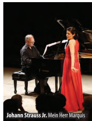
Johann Strauss Jr. Mein Herr Marquis