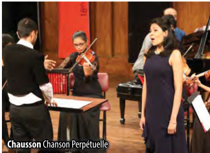
Chausson Chanson Perpétuelle