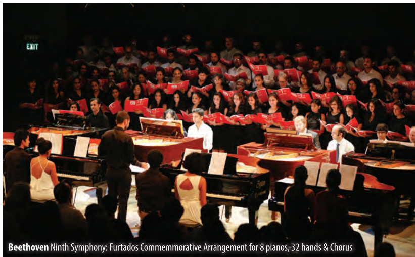
Beethoven Ninth Symphony: Furtados Commemorative Arrangement for 8 pianos, 32 hands & Chorus