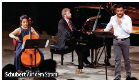
Schubert Auf dem Strom