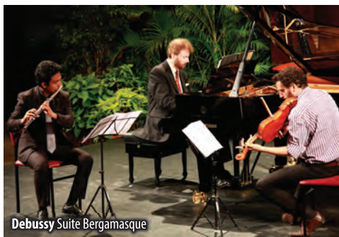
Debussy Suite Bergamasque