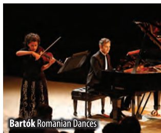
Bartók Romanian Dances