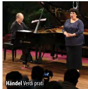
Händel Verdi prati