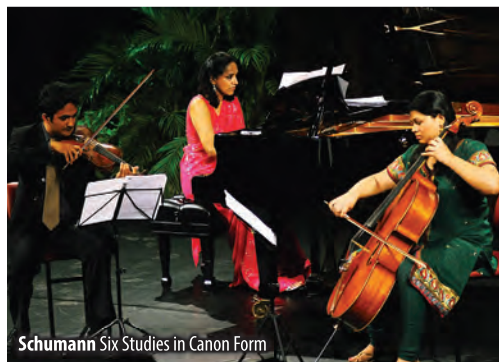
Schumann Six Studies in Canon Form