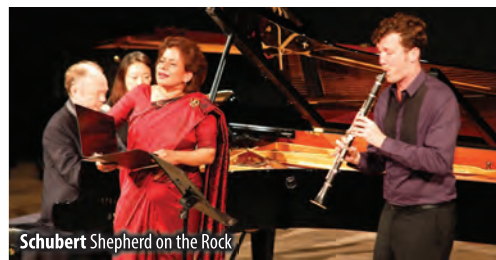
Schubert Shepherd on the Rock