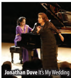
Jonathan Dove It's My Wedding