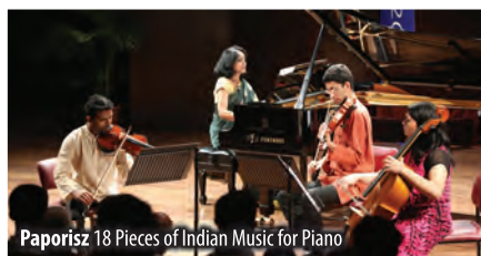
Paporisz 18 Pieces of Indian Music for Piano