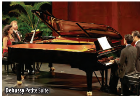
Debussy Petite Suite