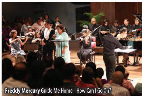
Freddy Mercury Guide Me Home - How Can I Go On?