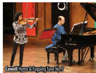
Cowell Hymn & Fuguing Tune No. 7