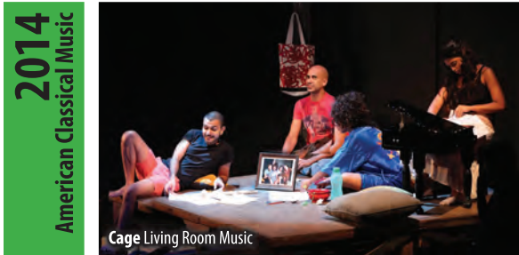
Cage Living Room Music