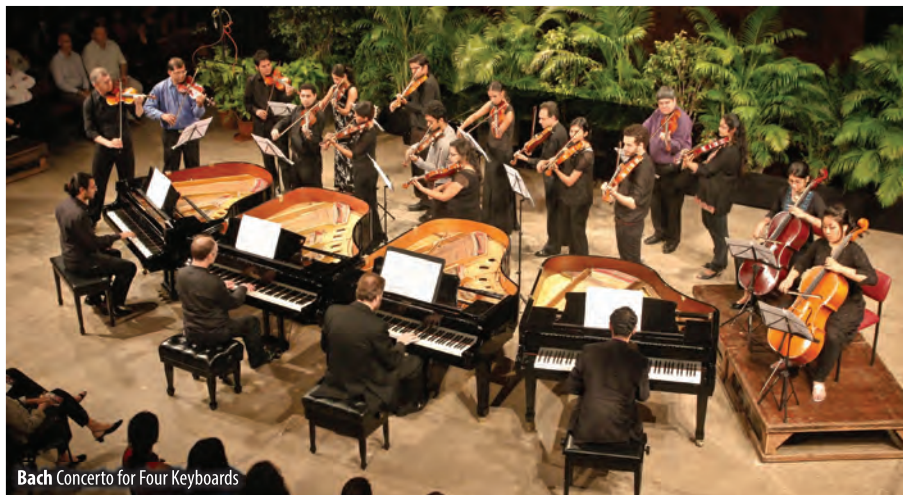
Bach Concerto for Four Keyboards