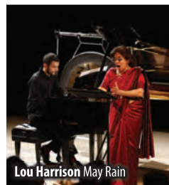
Lou Harrison May Rain